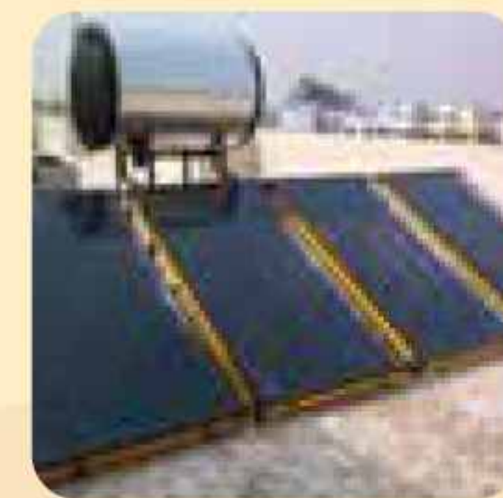
Solar Water Heater for common toilets