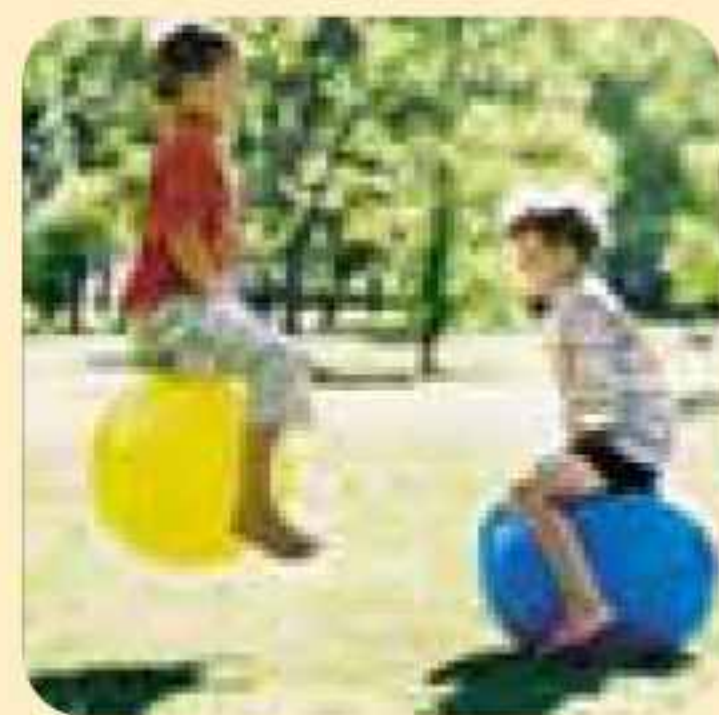
Children play Area