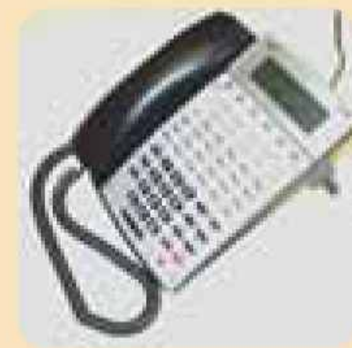
Intercom facility from security to flats