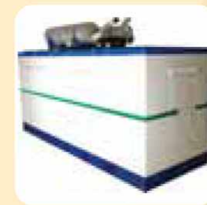
Generator backup for common areas