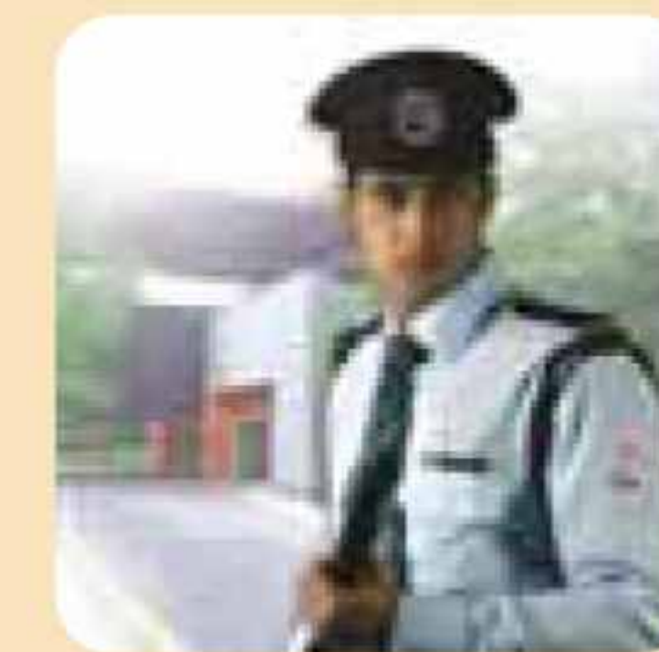
Around the clock Security