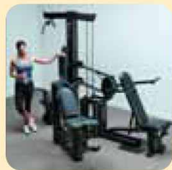
Gym/ Health Club