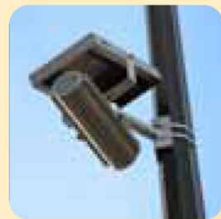
CCTV Surveillance at the Gate