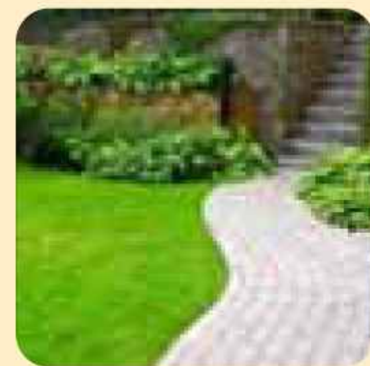
Landscape Garden & Water Bodies